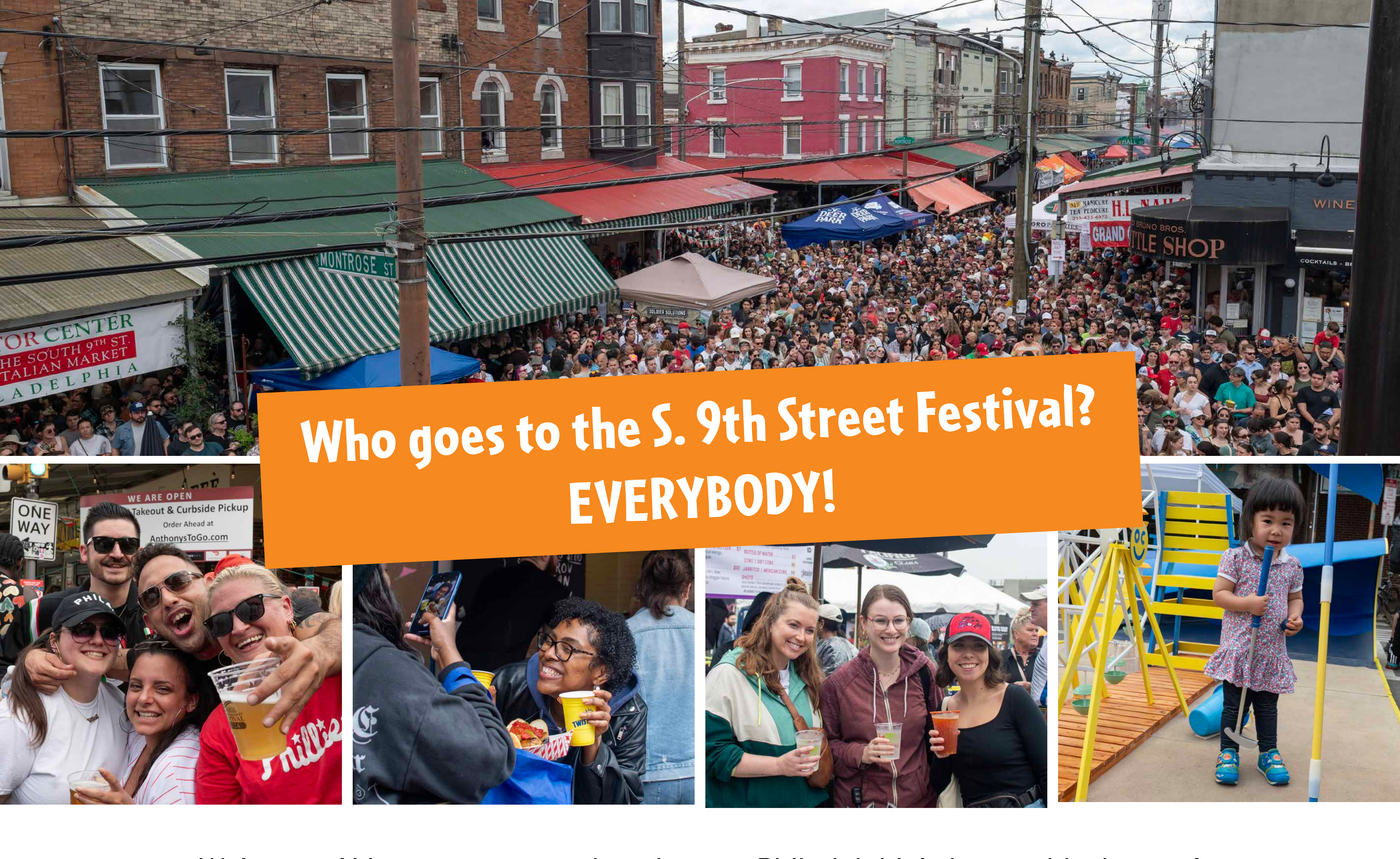
We've got ALL your target markets here at Philadelphia's largest block party!